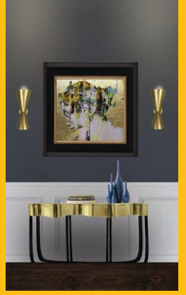
A special exhibit at Laguna Art-A-Fair will show different ways to display a piece of art in the home.

Lightopia, Famosa, Swing Tables and Mod Shop, as well as companies such as Interior Style Designs and Desiree Harding of Luxury Wall Finishes. Art-A-Fair partner UC Luxury Real Estate will offer advice on how redesign can increase home values.