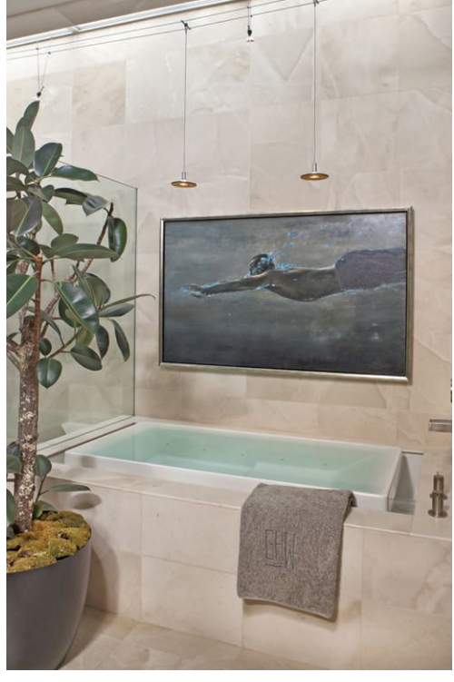
Designers advise homeowners to pick artwork they truly like, and ethereal pieces for rooms where tranquility is key.