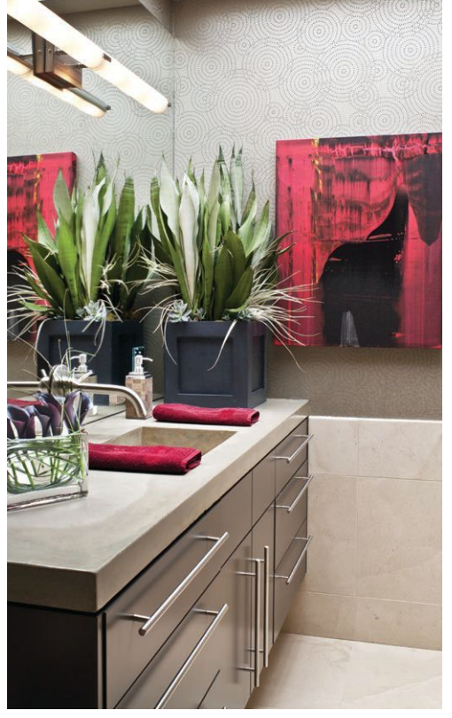
Colorful artwork can enhance a bathroom.

art will think about placement; they want to put it where it can be seen. Significant investment pieces should not end up in the garage or hall closet. ... If it contains a questionable subject or nudity, then the piece is typically put it in a bedroom."